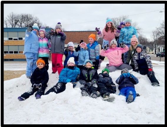
Enjoying winter and the snow hill.