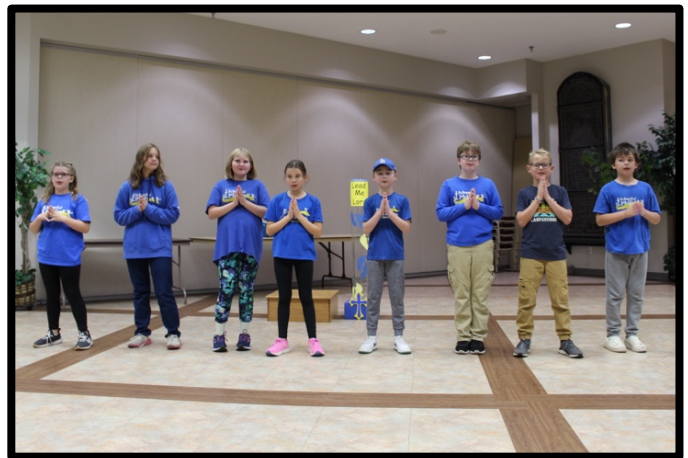
5 th Grade Graduates