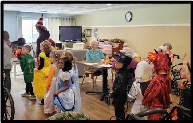
Spreading goodwill and cheer at the local nursing home.