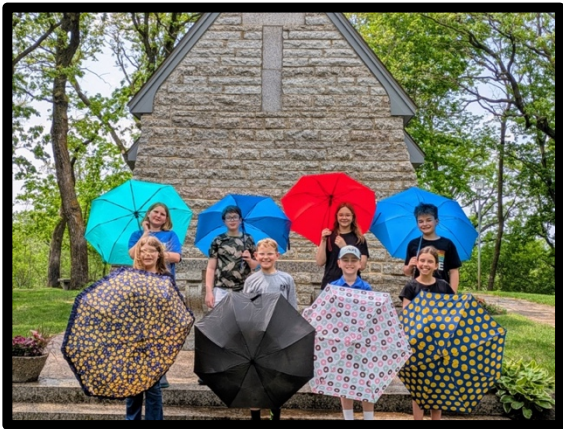
5 th Grade pilgrimage to Grasshopper chapel.