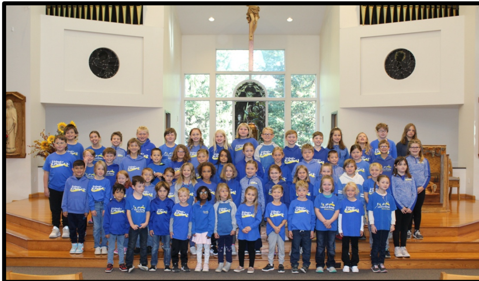
2024 Marathon – We raised over $70,000.