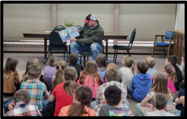
Senator Lang reading a story in honor of I Love to Read month.